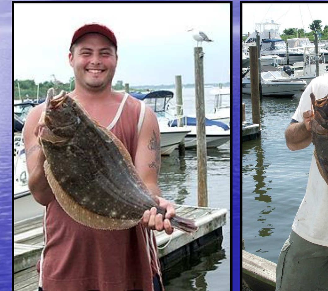
6.2 lb. fluke caught at Sandy Hook Reef